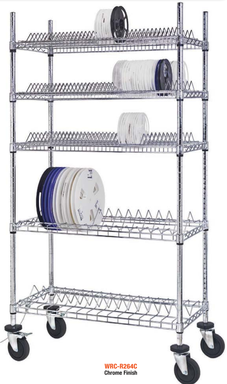
WRC-R264C Chrome Finish