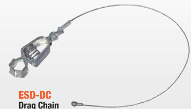
ESD-DC Drag Chain