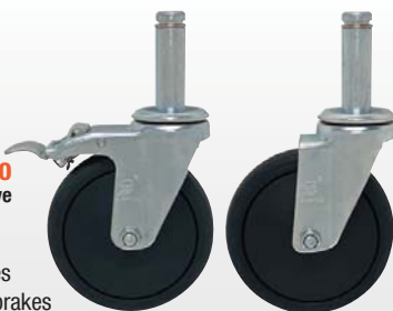
WR-SSCO Conductive Plastic Split Sleeves